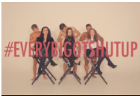
Blurred Lines, Not So Much: Double Standards at Play for Women in Music Videos