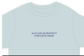
Etsy Pulls Rape-Promoting T-Shirts From Site Amid Outcry, Activists Push for Further Action