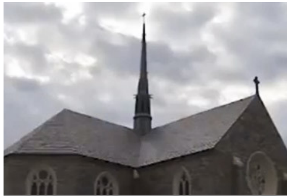
Resurrection of Our Lord Parish in Northeast Philadelphia