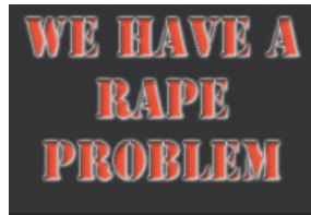
We Have a Rape Problem. First Step: We Have to Admit It.