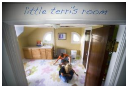
Kristen Woolley has applied personal touches to Turning Point's building on East Market Street in Springettsbury Township.